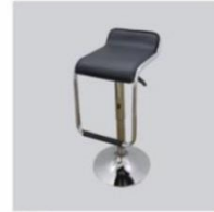
C206 Hydraulic Barstool ■ □